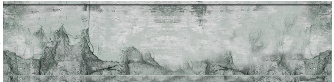
Image copied & flipped to lengthen. Detail floor and ceiling cornices added. Color shifted.