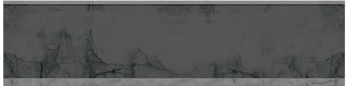
Black and white copy made to use as basis for Normal Map