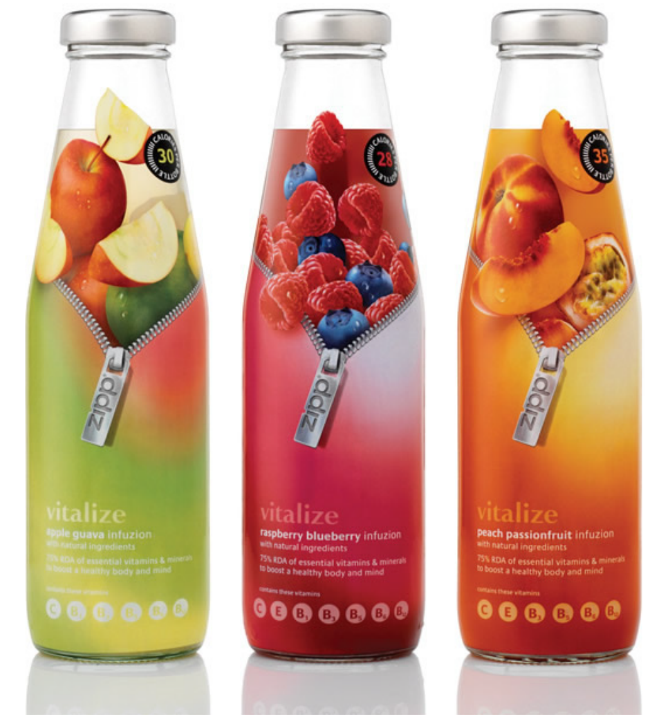
Illustrations clearly indicate flavors