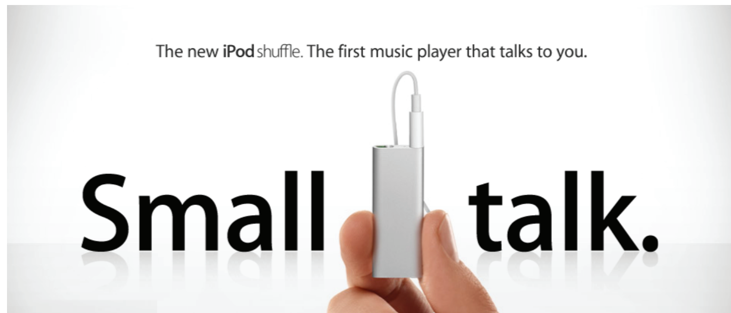
Text visually compliments the image

Is information presented in a meaningful manner?