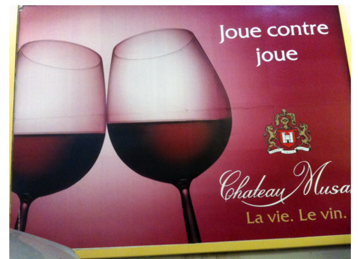
Less information can give a clean look of elegance and subliminal imagery