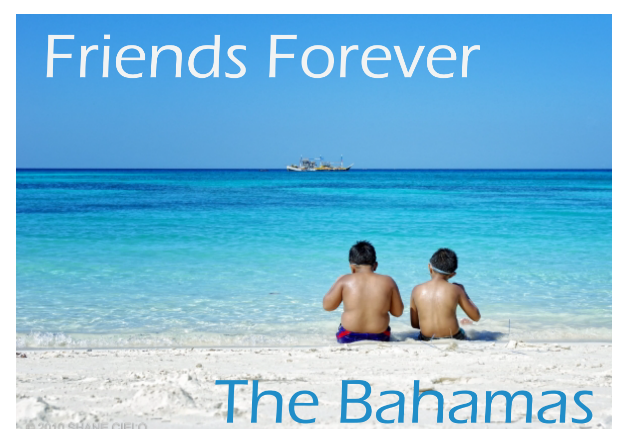
What's "The Rule of Thirds"?