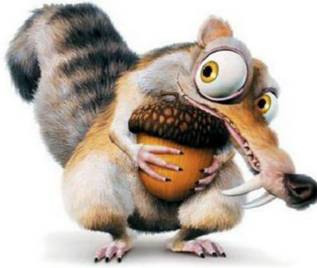
Big eyes and a small head

This is one of the guys who started this idea. Chaplin, a film star during the silent era, wore oversized shoes on his feet and an undersized hat on his head. His waist coat was small and his pants were too large. In the 1920's Chaplin was the most famous living person in the entire world.