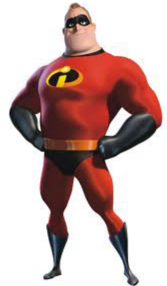
Small lower body and large upper body