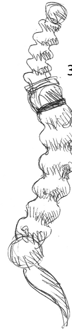
3D Max Hose and FFD distortion