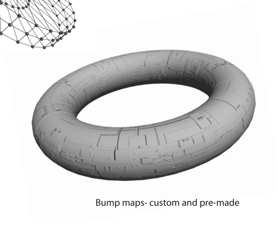
Bump maps- custom and pre-made